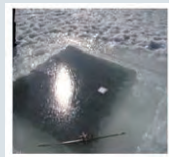
An instance involving the use of two-dimensional spectroscopy to distinguish between surfaces covered in water, ice, and snow (here, measured by Sentencia ).